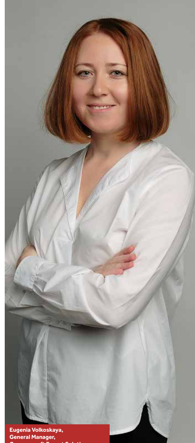
Gazpromneft Expert Solutions