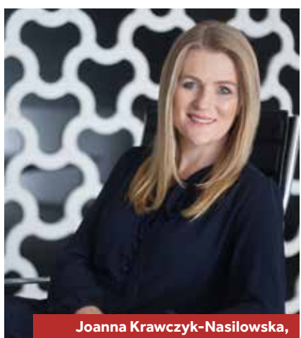
General Counsel, Ghelamco Poland